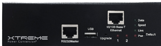
SPD-0215 front view