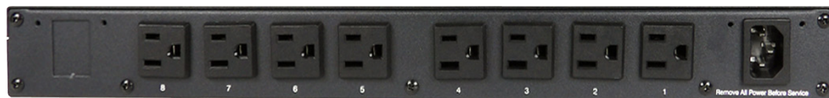
SPD-0815 rear view