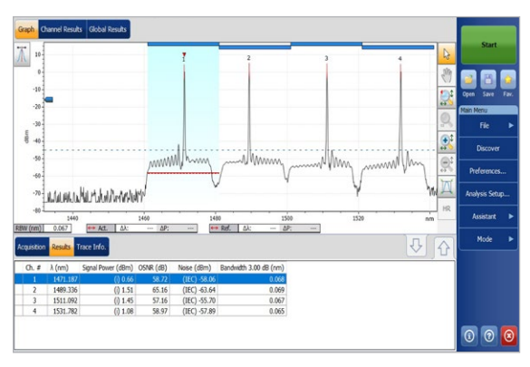
The FTBx-5235 displays channel power, channel wavelength and OSNR. Above: example of CWDM network OSA display. Below: example of DWDM network OSA display.

100 GigE deployments are now commonplace, triggering a transition from 10G and lower rate service (SFP/SFP+XFP) to 40G/100G using CFPs and QSFP28. This is in turn leading to multiwavelength client-side communications instead of single-wavelength transmissions. Since CFPs/QPSF28 have longer reaches (up to 10 km for LR4), meeting the loss budget is more challenging than ever before. Moreover, CFPs and QPSP28 greatly vary in quality, and sizable quantities of pluggables are simply defective. All these trends are calling for CFP/QPSF28 power measurements at the network element, where the client-side signals are converted to line-side signals. The FTBx-5235 is perfectly designed to assess the quality of pluggables in today's context of rapid network transformation.