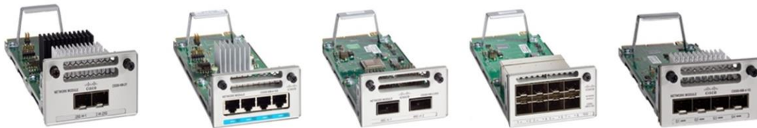
Figure 3. Cisco Catalyst 9300 Series Network Modules