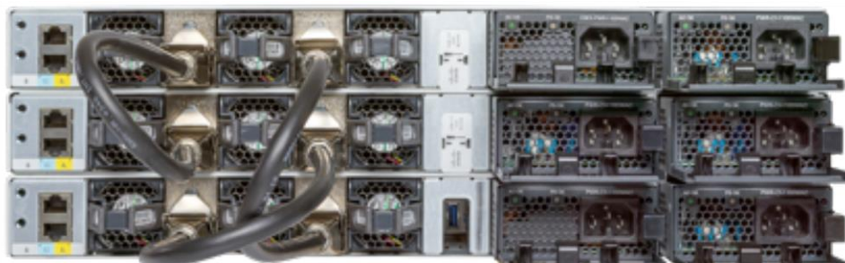
Figure 6. Cisco Catalyst 9300 Series fixed uplink models with optional stack kit