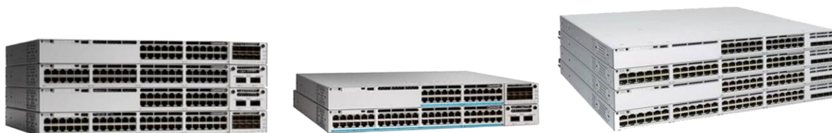
Figure 1. Cisco Catalyst 9300 Series switches

The Cisco Catalyst 9300 Series is made up of nineteen modular uplink switch models and fourteen fixed uplink switch models.