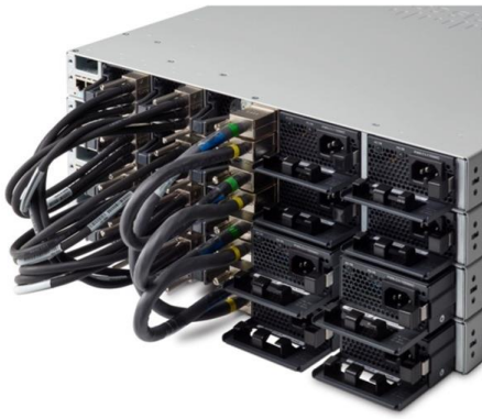
Figure 7. Cisco Catalyst 9300 Series StackPower