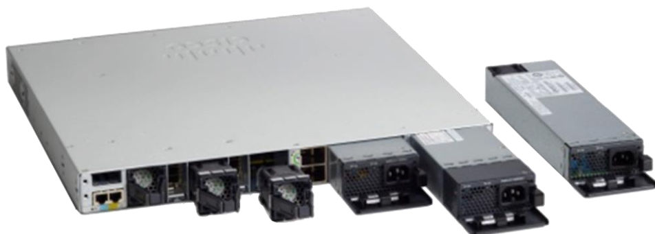
Figure 4. Cisco Catalyst 9300 Series Dual Redundant power supplies

Cisco Catalyst 9300 Series switches support dual redundant power supplies. The switches ship with one power supply by default, and the second power supply can be purchased when the switch is ordered or at a later time. If only one power supply is installed, it should always be in power supply bay #1. The switches also ship with three field-replaceable fans. Power Supplies are common across the Catalyst 9300 Series.