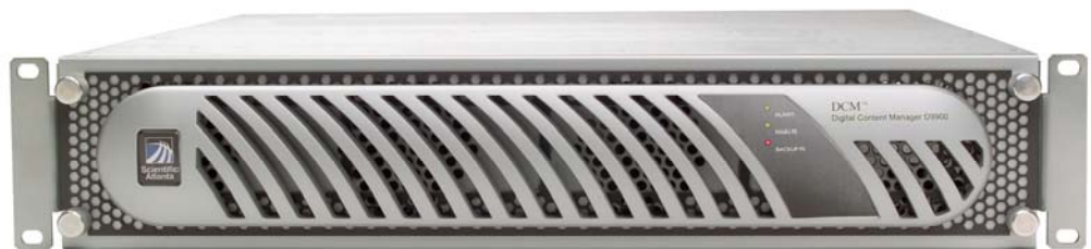
Figure 1. Digital Content Manager (DCM) Model D9900

Today's digital systems demand powerful, flexible and compact solutions that will allow the service provider to support new network architectures. The Digital Content Manager (DCM) Model D9900 MPEG Processor is a compact 2 RU platform capable of processing a high number of MPEG video streams. The DCM Model D9900 MPEG Processor is the next generation of intelligent headend processing equipment where the combination of compactness and flexibility leads to a cost-effective solution. Based on our experience, the DCM Model D9900 MPEG Processor should bring operational and economic benefits in MPEG processing applications. The optional built-in DVB scrambler allows easy integration with several Conditional Access (CA) systems.