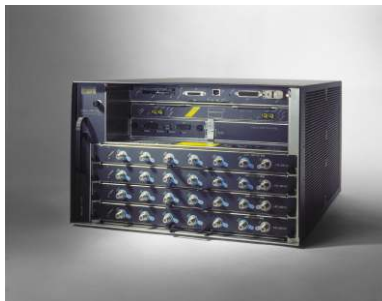
Cisco uBR7246VXR Universal Broadband Router