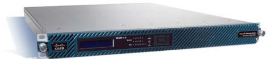
Figure 2 Cisco RF Gateway 1

The Cisco RF Gateway 1 is a highly dense, highly available and low-cost U-EQAM device, designed from the start to provide sufficient capacity to create a converged highly available Access/Edge.