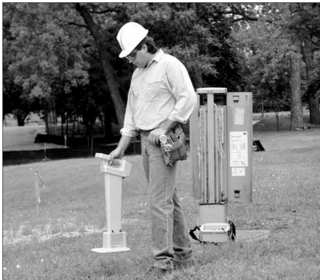
The Dynatel 2273 Advanced Cable/Fault Locator can be used with the Dynatel 2205/2206 EMS Marker Locating Accessory. 2

The receiver includes four volume settings, including a special “expander” function that makes peaks and nulls more pronounced. The expander feature enhances the amplitude difference between two conductors carrying the same signal, making the unit extremely accurate, even in congested areas. A headphone jack is also included.